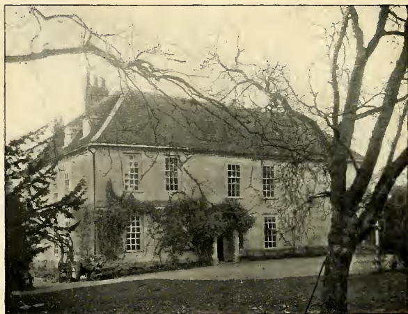
AN OLD COTTAGE, TOPPESFIELD, ENGLAND. THE RECTORY, TOPPESFIELD, ENGLAND.